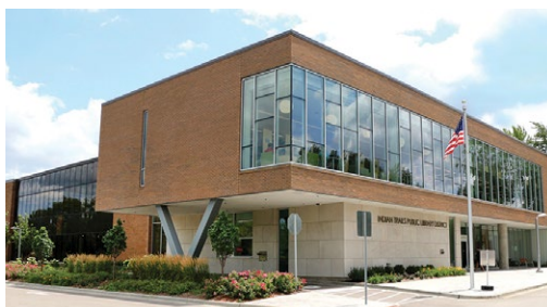
SUNDAY, DECEMBER 10, 12-2 PM Indian Trails Public Library