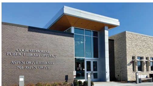
SUNDAY, DECEMBER 10, 1-3 PM Aspen Drive Library