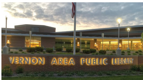
SUNDAY, DECEMBER 10, 1-2 PM Vernon Area Public Library