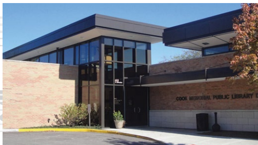
SUNDAY, DECEMBER 10, 1-3 PM Cook Park Library